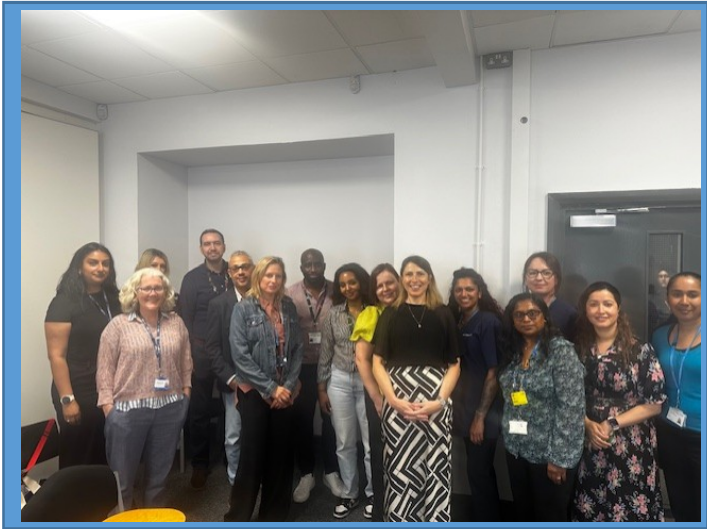
NWL insight day –NHS employer partners