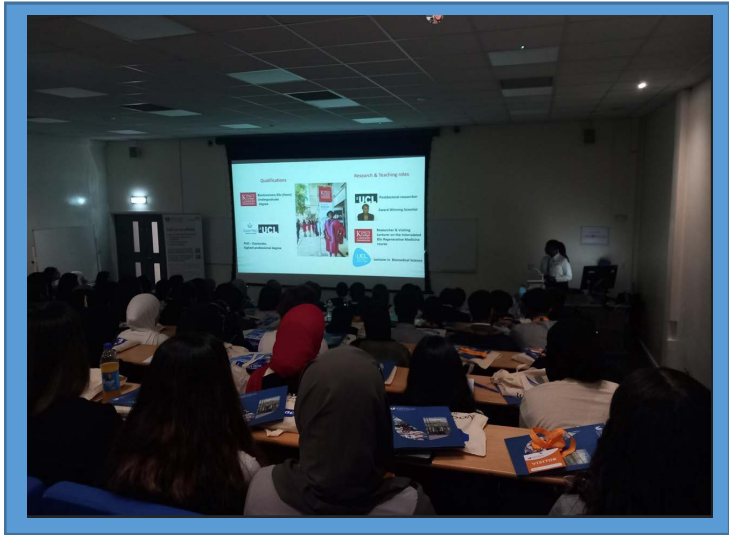
NWL Insight Day

(WIN) Design Lab held its first symposium at City Hall in March. This included announcing the winners from the first ever round of the Lab's Equity Projects in Progress Awards. A showcase for innovative new recruitment and retention programmes from the healthcare sector. Congratulations for West London NHS Trust for winning " The Breakthrough" for a comprehensive anti-racist policy with mechanisms for reporting and addressing issues and safe spaces for discussion and reflection. Read more here .