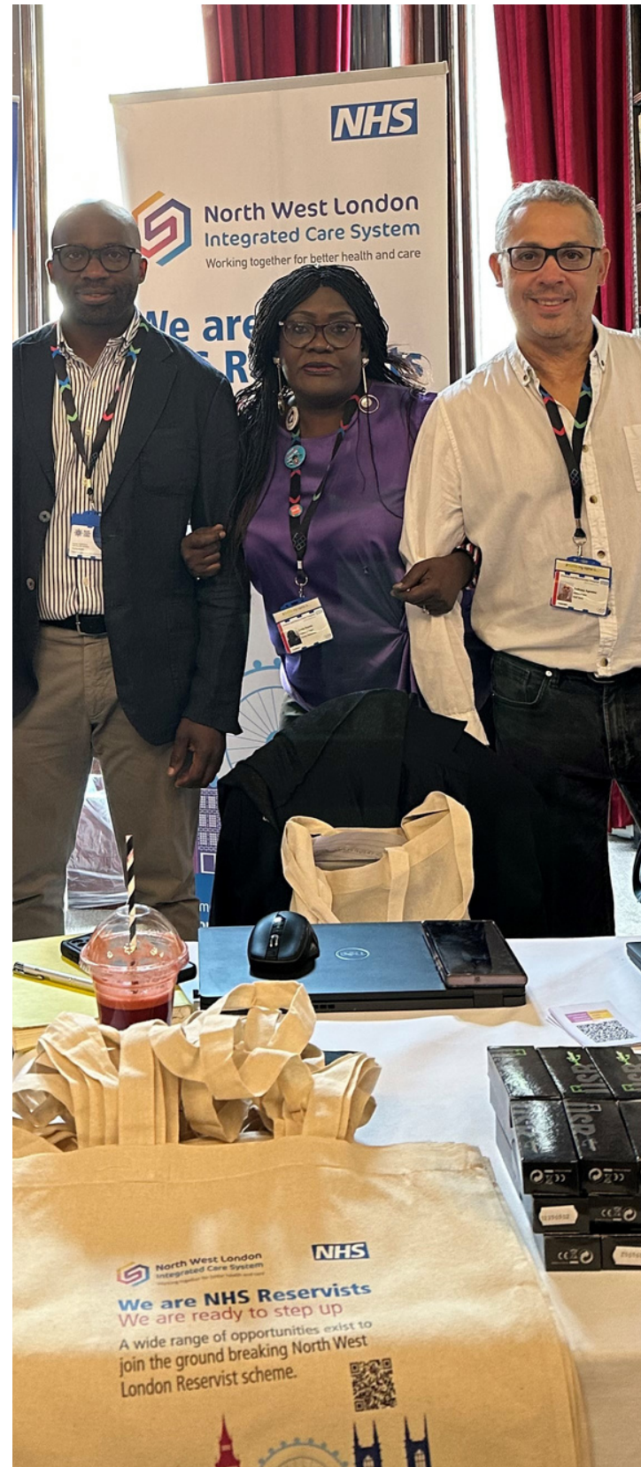
This photograph was taken in June at a Ukrainian Refugee Job Fair which attracted about 800 job seekers.